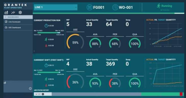
*Line Efficiency Dashboard in Perspective

For more information on Grantek's OEE Accelerator and other Solutions, visit grantek.com